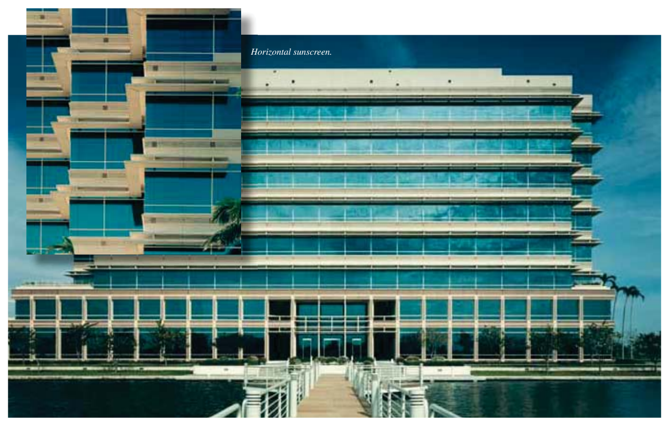
A horizontal sunscreen is used on the Cornerstone office building in Florida to reduce solar heat gain, while permitting daylighting and views.

were designed and placed to balance the simultaneous needs for privacy and spectacular views, while reducing heat loss/gain and the glare caused by sunlight. The windows were placed within a wall panel and tested as a unit to verify the highest possible standards of performance. Thus, the tools of a traditional wall, even in the context of a high-rise building, were shown to have "green" benefits and to produce an environment that is simultaneously up to date and comfortable, physically and psychologically.