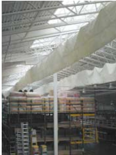
Figure 3. Daylighting in the Warehouse

The light fixture placement complements the daylighting design – fixtures are located in rows parallel to the clerestory. The zoning for the lighting was established by observing lighting levels with various combinations of lamps on during a sunny afternoon/evening. Eight “lighting patterns” were identified and hard-wired. When all eight zones of lights are on, the lighting density in the hardware store is 1.21 W/ft 2 .