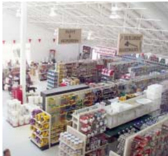
Figure 2. Daylighting in the Retail Space

The largest energy savings result from using daylight to meet most of the lighting loads. The focus of the envelope design was to maximize the daylighting potential while balancing the heating and cooling requirements. It is estimated that daylighting will reduce the lighting load by 79% compared to the base-case model. Figure 2 shows daylighting on an overcast day in the retail space during construction.