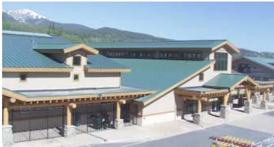
Figure 1. Phase III Front Façade (East Elevation)

Phase III, completed in April 2000, houses a hardware store with an associated building materials warehouse (Figure 1). This phase incorporates the most aggressive sustainable design strategies of the three phases. Improvements based on lessons learned in Phases I and II are part of the Phase III design. These strategies include daylighting, advanced lighting technologies, natural ventilation cooling, transpired solar collector, building-integrated PV, improved envelope features, and integrated controls. This paper describes the Phase III building.