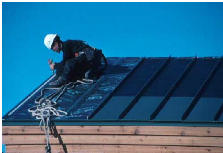
Figure 5. Installation of the Photovoltaic Roof

Building-integrated photovoltaic system. Figure 5 shows the BigHorn Center Phase III roof-integrated photovoltaic (PV) system. Photovoltaic modules laminated onto the standing-seam metal roof panels were installed on the south-facing roofs of the hardware store clerestory and the warehouse center dormer (Ovonic 2000). The amorphous-silicon PV modules were wired into three arrays, each serving one phase of the 3-phase building power system. The design capacity of the PV system is 8 kW. The BigHorn Center owner has a net metering agreement with the local utility to receive full credit for power that the PV system exports back to the grid.